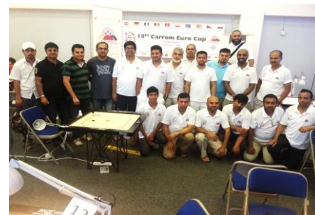
UK Team & Players