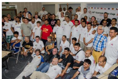
96 players and participants from 10 European nations

Epic and thrilling last day of single final ended in tears and happiness. After 3 days of Carrom playing marathon of the 18 th Carrom Euro Cup for Singles, Doubles and Team events Organized by UK Carrom Federation under European Confederation at the LSE, Bankside House in Southwark. More than one hundred players and members from ten (10) countries of Europe (Czech Republic, France, Germany, United Kingdom, Italy, Poland, Spain, Sweden, Switzerland, and Bulgaria) participated in the tournament.